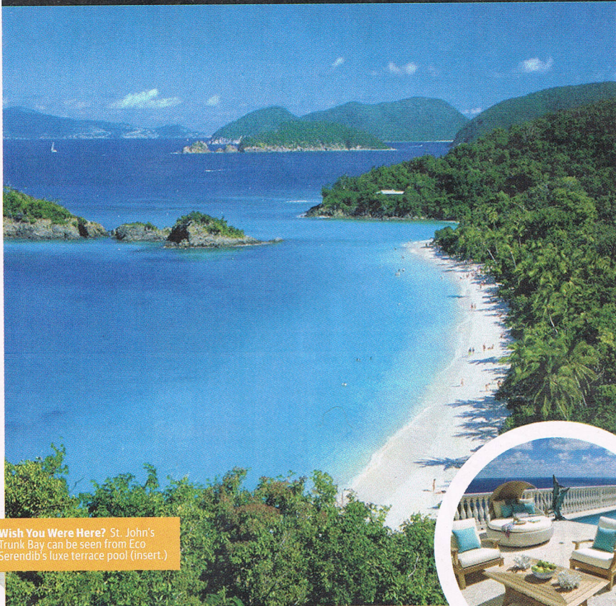
Wish You Were Here? St. John's Trunk Bay can be seen from Eco Serendib's luxe terrace pool (insert.)

The owner of Capogiro takes us on her twice-yearly trek to New Orleans.